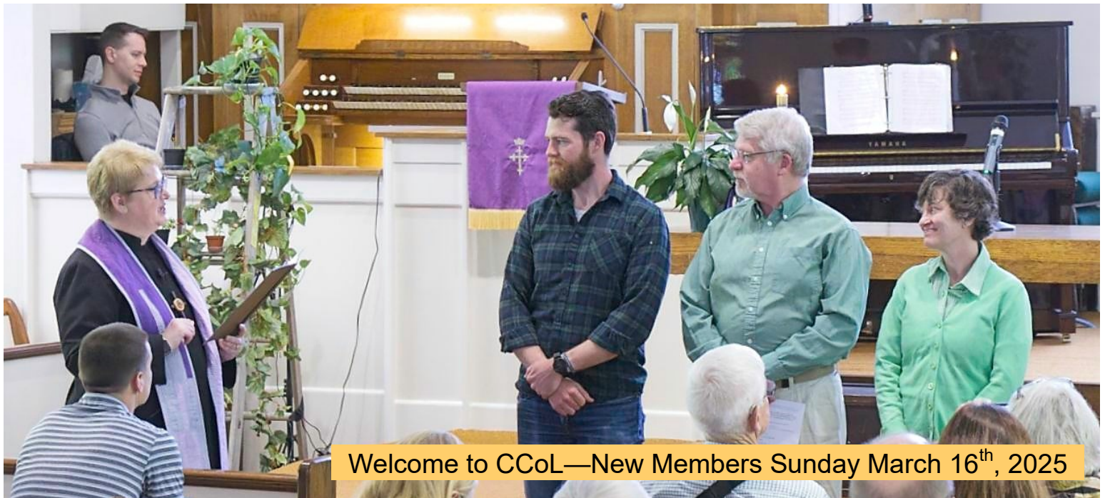
Welcome to CCoL—New Members Sunday March 16 th , 2025