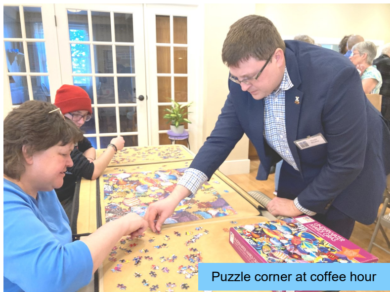
Puzzle corner at coffee hour

Gordon's website is: www.guernseycove.ca